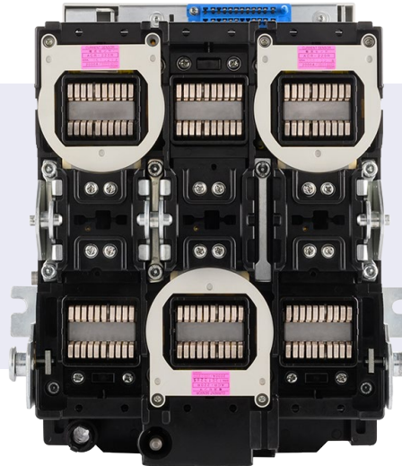
Rear side of the breaker