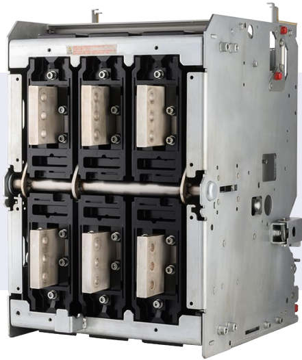
Rear side of the cradle

Please provide a photograph of the rear side of the cradle clearly showing the bus bar connections. (Not the breaker).